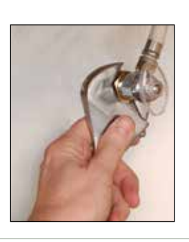
Step 6: Connect to the On Command Circulator